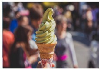
Healthy additives for various kinds of food and drinks