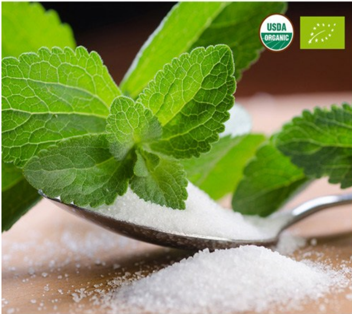
Organic-certified Stevia Powder

In the European markets, most people prefer sweet tea powder. In order to meet the market demands, we have launched organic stevia white tea powder .