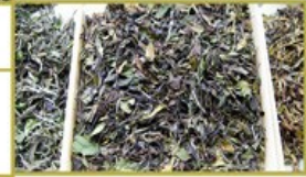
2. Selecting fresh tea leaves