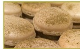
5. White tea powder People mainly use the white tea powder to make various food, drinks, and so on.