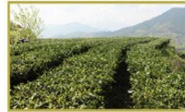
1. Natural organic white tea plantation White tea directly from our tea farm.

Intake of the same nutrients, the amount of tea powder will be more than drinking tea liquid.