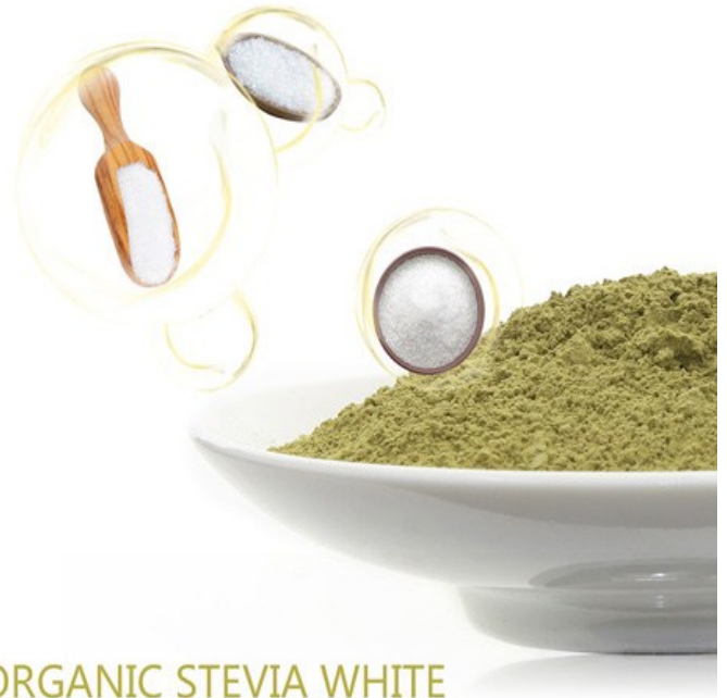
ORGANIC STEVIA WHITE TEA POWDER

Organic white tea powder mixed with organic stevia, smooth taste without bitter and astringent , all people can drink. Organic stevia white tea powder is healthier for us.