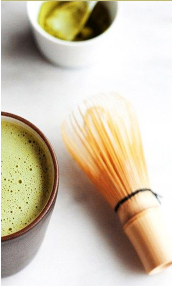
ORGANIC WHITE TEA POWDER