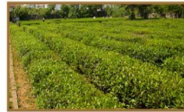
1. Natural Organic oolong tea plantation Oolong tea directly from our tea farm.

Intake of the same nutrients, the amount of tea powder will be more than drinking tea liquid.