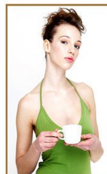
Reduces obesity func- tion as an antioxidant