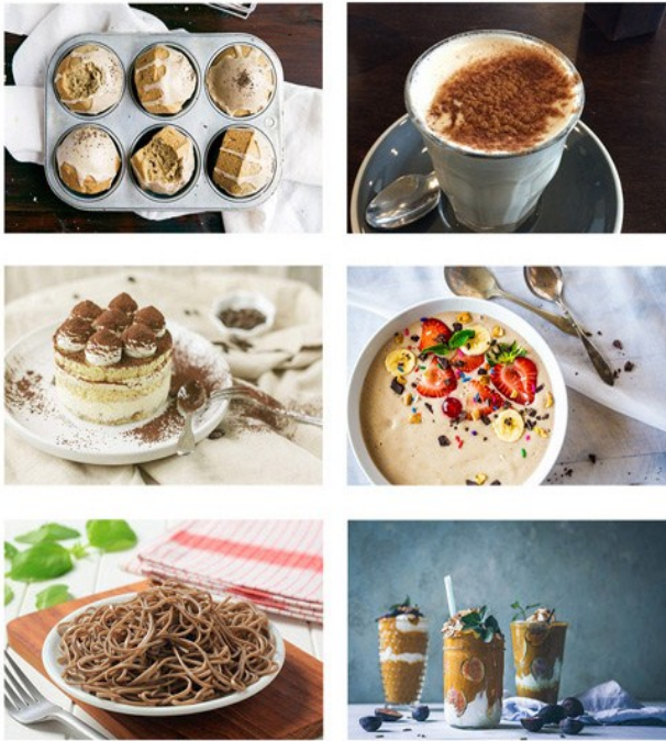
Healthy additives for various kinds of food and drinks