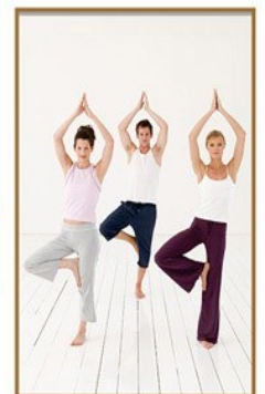
Strengthens bones & prevent osteoporosis