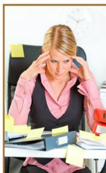
Relieves stress and improves mental health