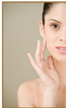
Relieves atopic dermatitis