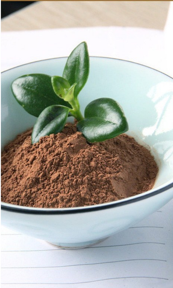
ORGANIC OOLONG TEA POWDER