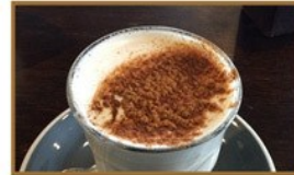
5. Organic Oolong tea powder People mainly use the oolong tea powder make various food, drinks, and so on.