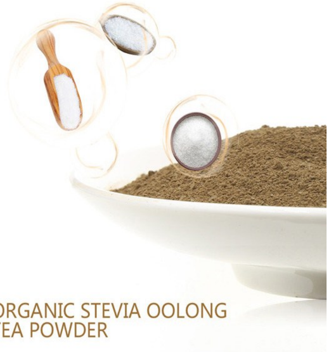
ORGANIC STEVIA OOLONG TEA POWDER

Organic oolong tea powder mixed with organic stevia, smooth taste without bitter and astringent, all people can drink. Organic stevia oolong tea powder is healthier for us.