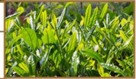
2. Selecting fresh tea leaves