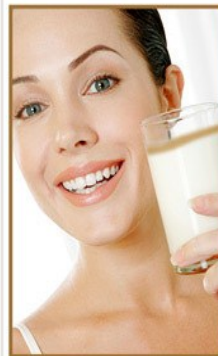
Protects teeth against decay