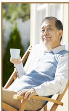
Prevents cancer Controls diabetes